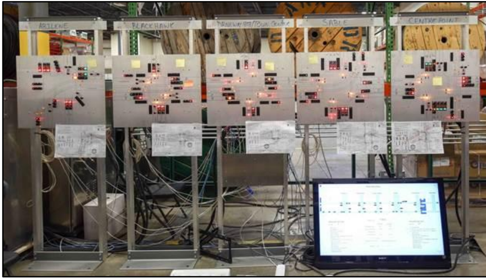
Figure 3 – Area B Bench Test

The first part of bench testing for Area B focused on the five crossings between the Florida and Aurora Metro Center stations. The light boards for each crossing are each hooked up to a separate signal controller, while the screen at the bottom displays the status of trains during each test.