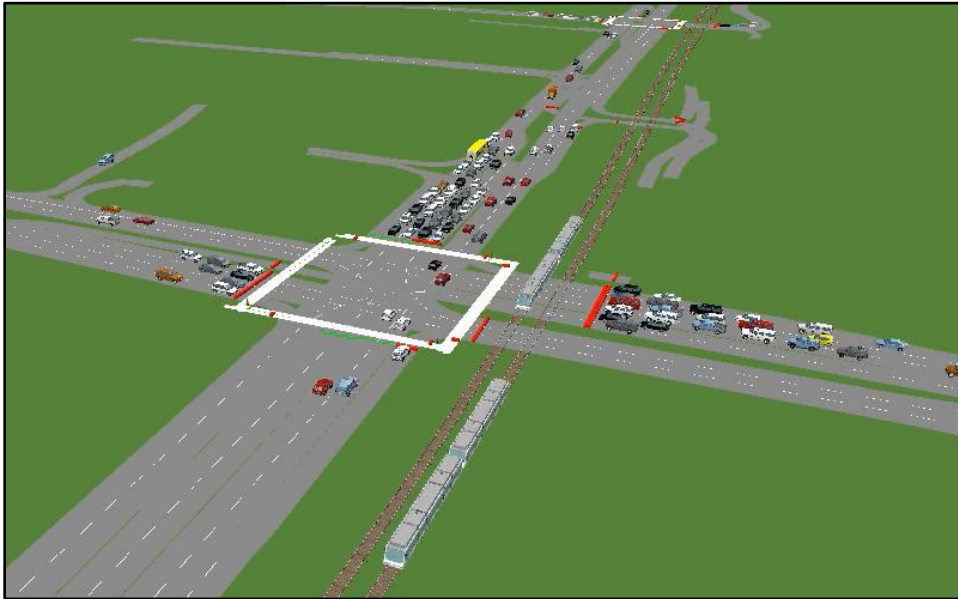
Figure 2 – Vissim Simulation

This screenshot, captured during a simulation run of the Area B PM Peak Vissim model, shows two trains crossing Alameda Avenue in parallel with the vehicles on northbound and southbound Sable Avenue. The linked crossings at the Commercial Access and Bayaud Avenue are visible in the background.