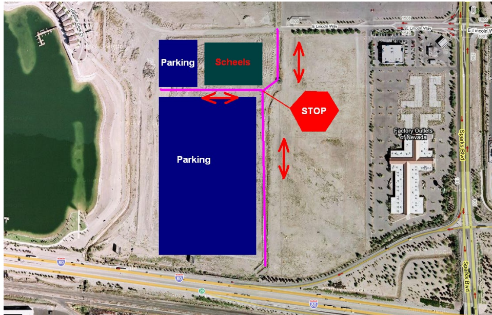
Figure2. Observation Location

generations and highest parking demands, were collected for the site. (Trip generation data was collected on vehicles and bicycles only, not pedestrians.) Information was gathered during 7:00am to 7:00pm each day. All data was collected via manual counts by student chapter members, with the observations being conducted in view of the major entry/exit point of the site, which is around the stop sign area shown in Figure 2.