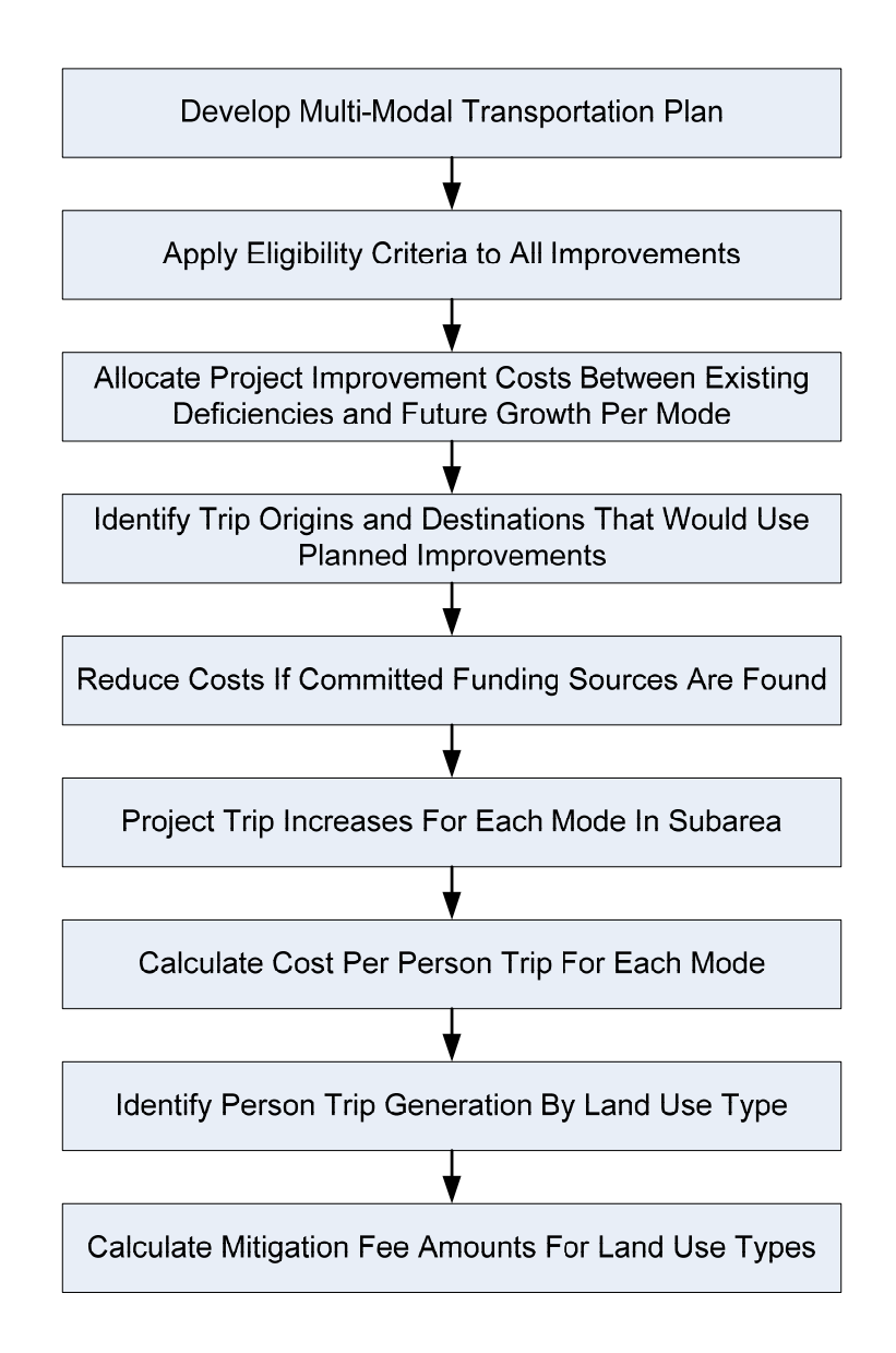
Figure 1. Steps Applied to Develop Seattle's Multi-Modal Mitigation Payment Program