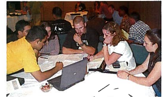
Students work together to solve a transportation problem during the James H. Kell competition.

In addition to providing opportunities for students raise funds to offset the cost to attend Annual Meetings, the District also subsidizes Annual Meeting registration fees for students and their Faculty Advisors to encourage their attendance at the meetings. Student attendance at Annual Meetings has increased significantly from five to over eighty students in the past six years.