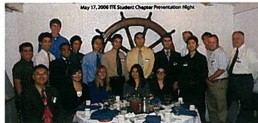
The new UCLA Chapter participates in the Southern California Section's Student Night.

In addition to supporting existing Student Chapters, the District encourages and assists in the establishment of new Student Chapters. To ensure that students have access to current references, this support can take the form of library materials and technical software for Student Chapters.